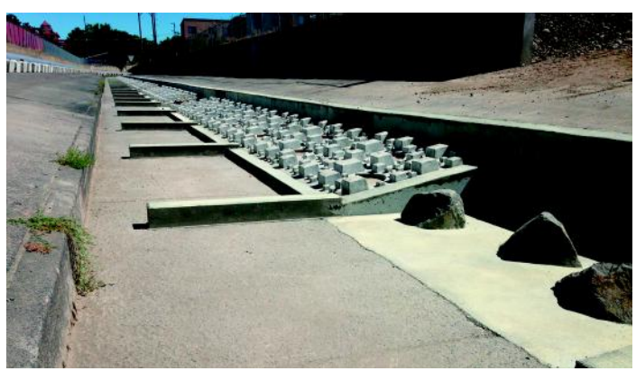
The completed channel, showing roughness panels, new baffles, and a resting pool.

The passage improvement uses "roughness panels" to reduce the velocity to a