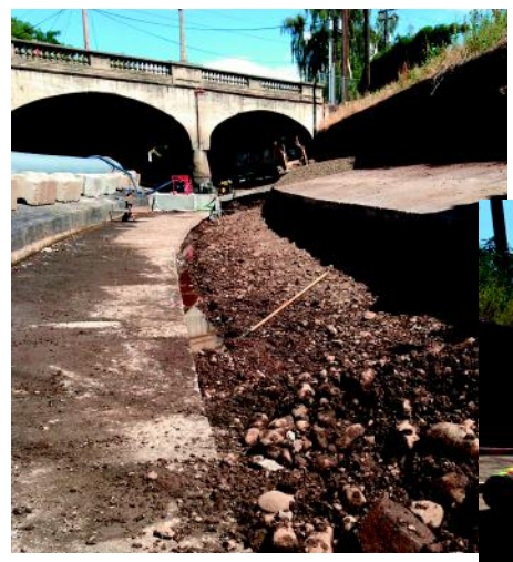
The existing concrete is cut and removed to make room for the roughness panels (above and right). Then concrete is poured in place to re-seal the channel (below).

This is the fourth passage project in Mill Creek completed by the Steelheaders. These projects have been conducted in cooperation with the Walla Walla County Public Works Department. Designs for each project have been reviewed by the Corps of Engineers. Funding for this project was provied by the WA Salmon Recovery Funding Board, with matching funds provided by Confederated Tribes of the Umatilla Indian Reservation and Bonneville Power Administration