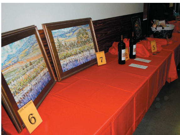
A portion of this year's live auction, made possible by generous support from local businesses and artists.

at the Ocean Lodge in Cannon Beach, custom patio furniture, and a 70 inch TV. Silent auction items included paintings, carvings, wine, and fishing gear. In all, 95 business and individual donors contributed to the event. And let's not forget the volunteers. It took