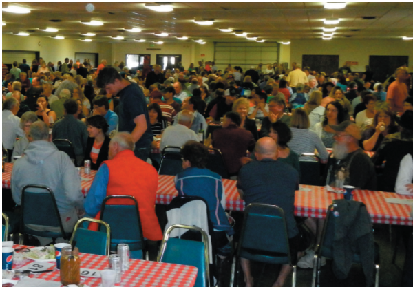
With 500 in attendance, it was a full house.

This year's Crab Feed Fundraiser was attended by 500 people ready to enjoy good food and a good time. With over 50 lots, the Dollar Raffle included merchandise and gift certificates from local businesses. The Live Auction featured original art by Jeff Hill, wines from L'Ecole and Leonetti, accommodations