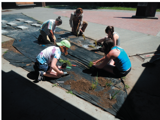
Students replace lawn with native plants.