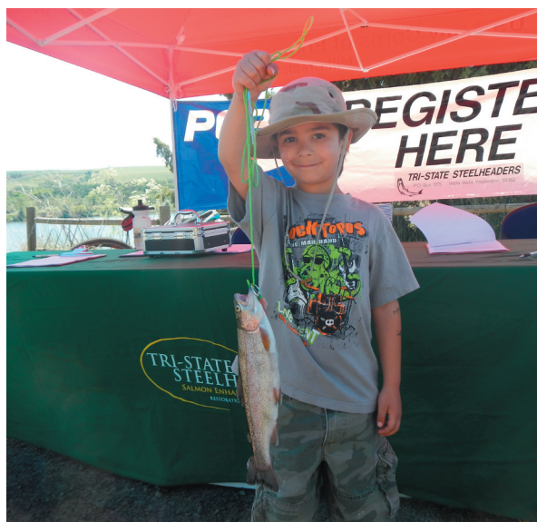
Twenty tagged fish were stocked at Bennington Lake before Kids' Fishing Day. Here's one of the lucky winners!