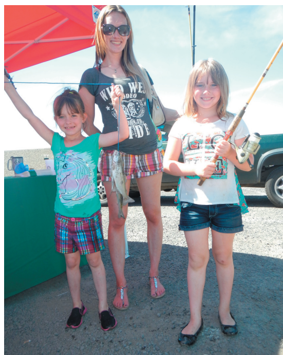
Washington Dept. of Fish & Wildlife stocked the lake with 2,000 trout prior to the event. These young ladies caught two, and one was a prize-winning marked fish!

Selby, who refurbishes used fishing rods to provide to those without their own at Steelheaders events